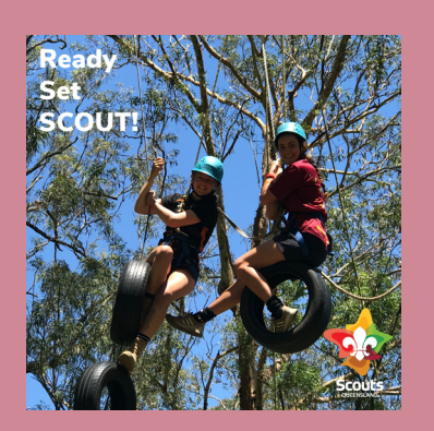
6pm, Friday 19 February