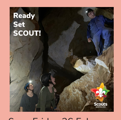
6pm, Friday 26 February