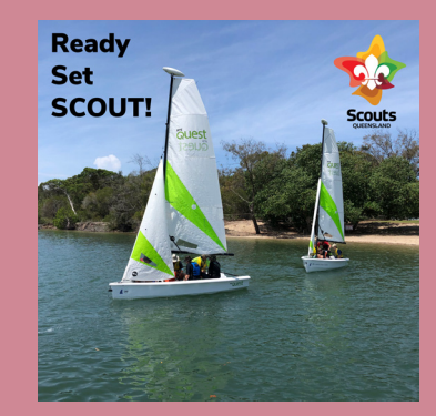
6pm, Monday 15 February