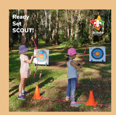
6pm, Wednesday 27 January