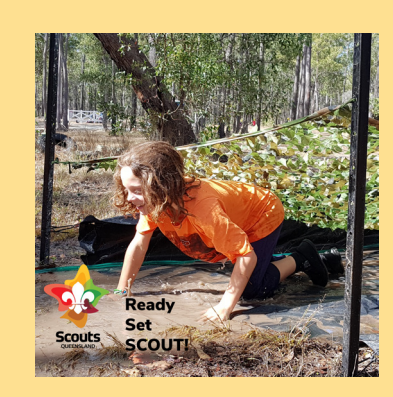
6pm, Friday 5 February