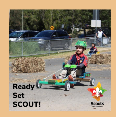
6pm, Friday 29 January