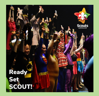
6pm, Monday 8 February