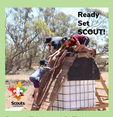
6pm, Friday 12 February