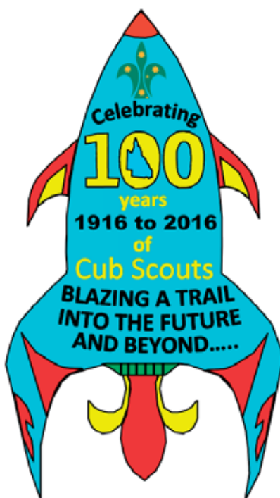
ORIGINAL SUBMISSION AND ADAPTED