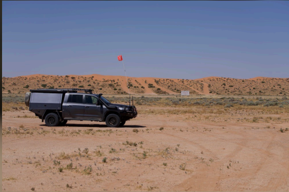
Simpson Desert "Big Red" Sand Dune