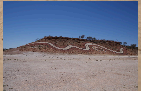
Dreamtime Serpent Betoota