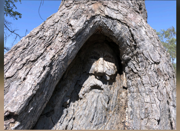
Burke and Wills Dig Tree