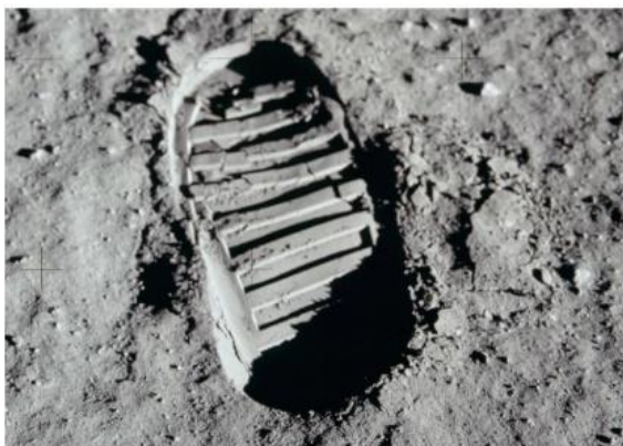
Figure 8.15-1. A footprint left on the Moon by Buzz Aldrin (Apollo 11). Detail of photo AS11-40-5877.

When the first humans landed on the Moon; they left behind some very famous footprints too!