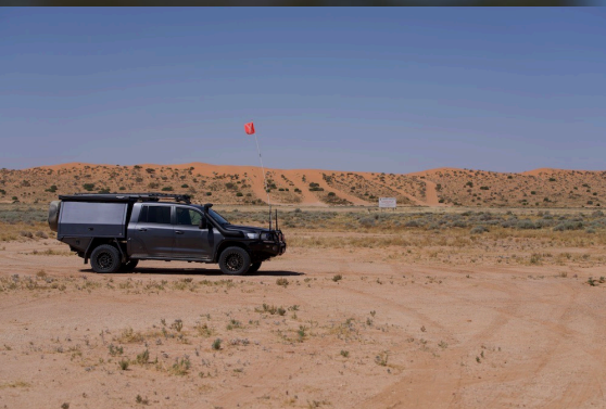
Simpson Desert "Big Red" Sand Dune

Saturday 23 September to Monday 4 October 2023 (After Agoonoree)