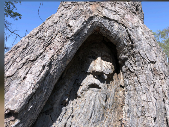
Bourke and Wills Dig Tree