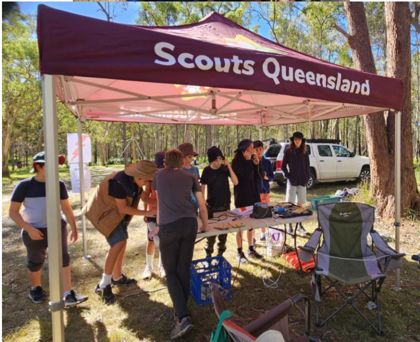
Tyakunda District’s “ Power to the People “ - erecting power poles and communication lines