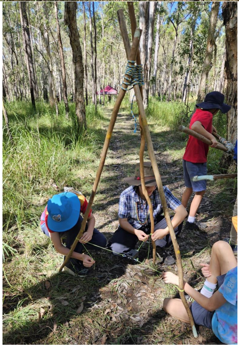
Sir Leslie Wilson District’s “The Explosives Store” – moving explosives without triggering an explosion.