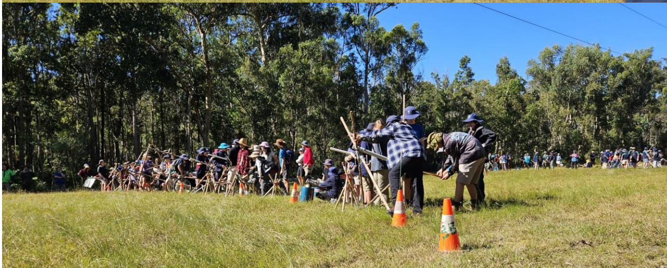
The Ureeka Rebellion Patrols - prepare to fire at the Governor's residence.