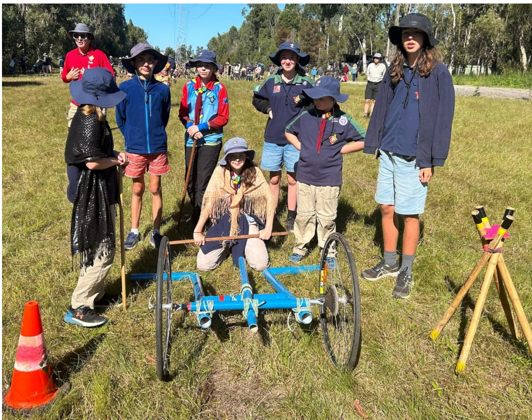
Some interesting “Canon “ designs at the Ureeka Rebellion