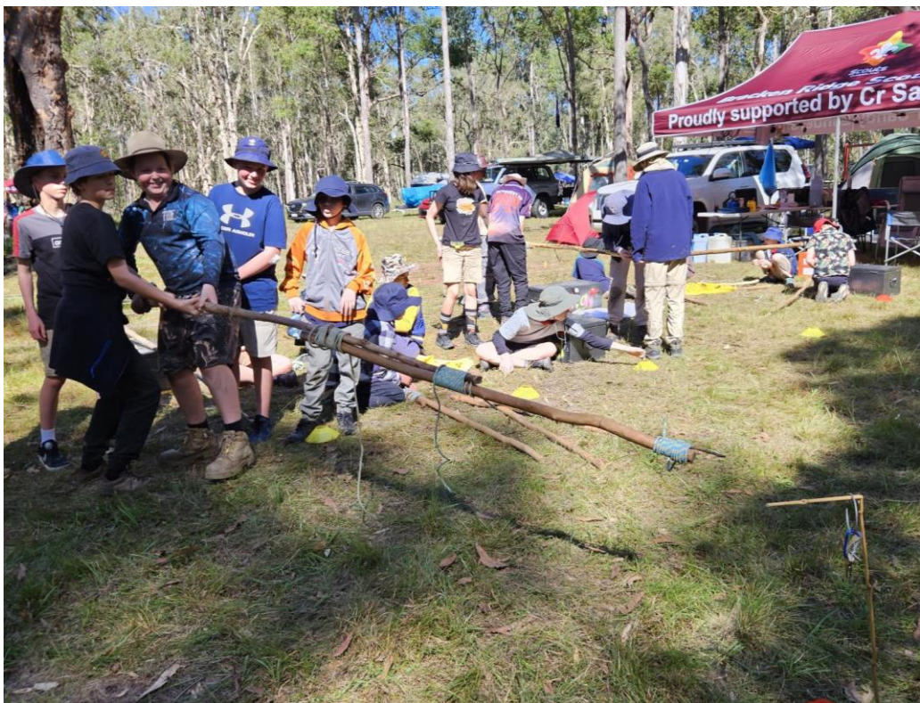
Bramble Bay District’s “The Bank” Build a Stretcher to carry the box of Gold Bullion , navigate a maze and steal the keys for the box from the sleeping security guard.