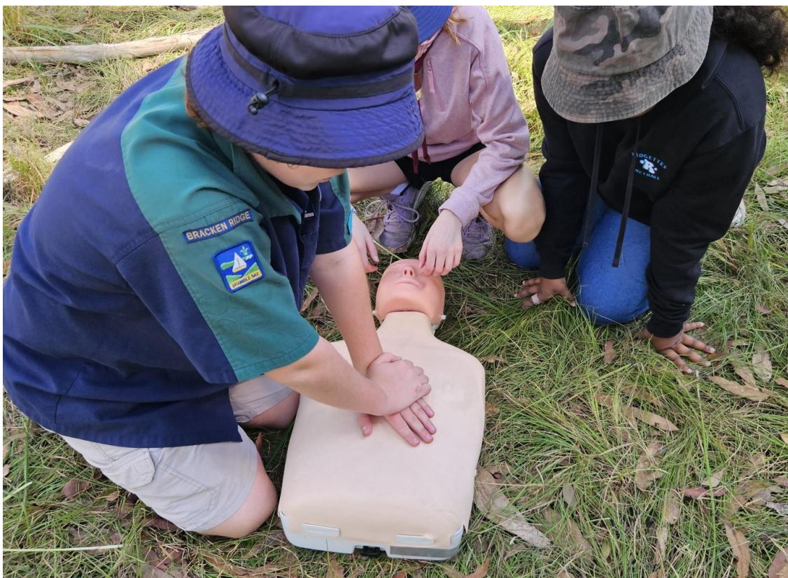
Sir Leslie Wilson District's Ironbark Venturers' "The Hospital" – triage and first aid following a mine shaft collapse.